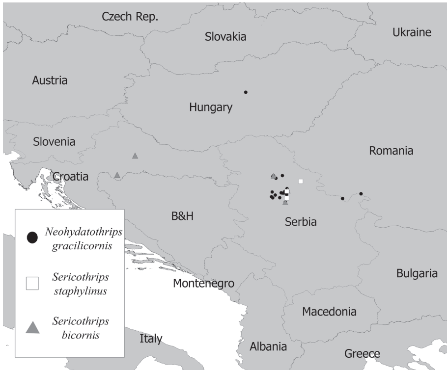
Fig. 1. - Distribution map of records of N. gracilicornis (black dots), S. staphylinus (white squares) and S. bicornis (gray triangles) from the collections of the Natural History Museum in Belgrade.

We have recorded thrips specimens on the plants from family Fabaceae, belonging to genera Vicia sp., Lathyrus sp., Genista sp. and Coronilla sp. There were also several specimens recorded on the plants that do not belong to the Fabaceae family, for example Echium sp. and Galium sp. This confirmed the well-known fact that thrips visit many different plants, but they feed and reproduce only on certain plant species from certain family.