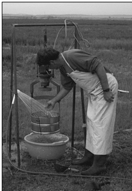
Fig. 1. - Sieving sediment.

to be processed. In both cases sifting is performed with specially constructed vibro-sieves (Fig. 1).